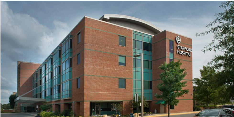
Approved MWHC pictures from marketing team